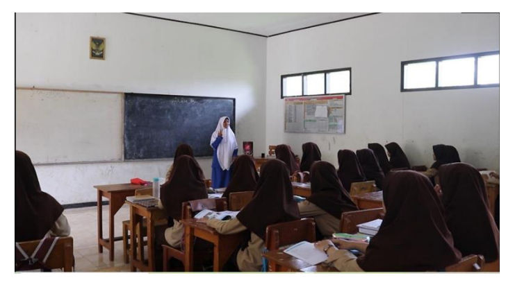
Fig. 2. Teacher is explaining the rules of the game

This game has enabled the teacher to encourage the students to share their thoughts by answering the types of colours, shapes or types of the object in English. The students were given three chances to mention the category, after the three chances were up students have to guess what the name of the object was. If the name of the object mentioned was correct, the student deserved to get it. While the game was running, the students were so excited. The teacher saw from their expressions that they were very happy and involved in this game, and enthusiastic to mention more clues from each tools. In this stage, the teacher also performed the code-mixing of English, Arabic, and Indonesian language. The teacher provided the following transcriptions of my code-mixing practice: