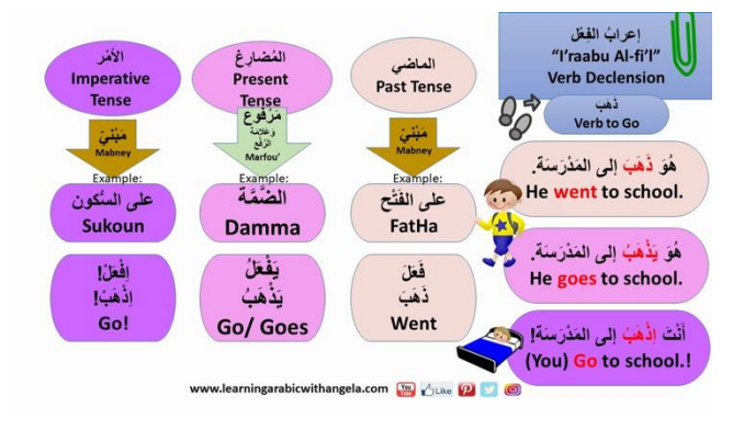
Figure 3. The past tense system of English and Arabic

used to explain past tense system in English and Arabic language.